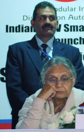
SMT. SHEILA DIKSHIT HON'BLE CHIEF MINISTER