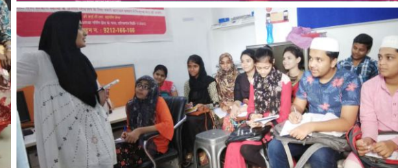
Ongoing Tuition class at SASHAKT Daryaganj