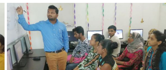
Ongoing 3rd batch of Computer Accounting at SASHAKT Daryaganj