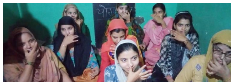
June 21 - International Yoga Day celebrated at all BYPL Mahila Shiksha Kendras