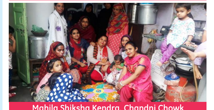
Mahila Shiksha Kendra, Chandni Chowk