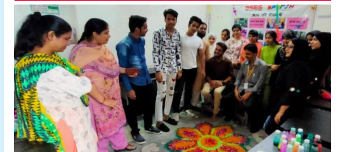
Sashakt Vocational Training Centre, Daryaganj