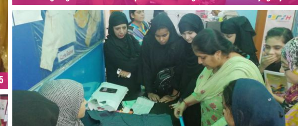
Ongoing 3rd batch of Cutting & Tailoring at SASHAKT Daryaganj