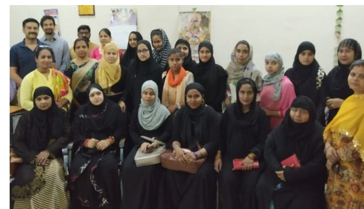
20 new Mahila Shiksha Kendra(MSK) instructors' introductory meet at Yamuna Vihar office on April 25