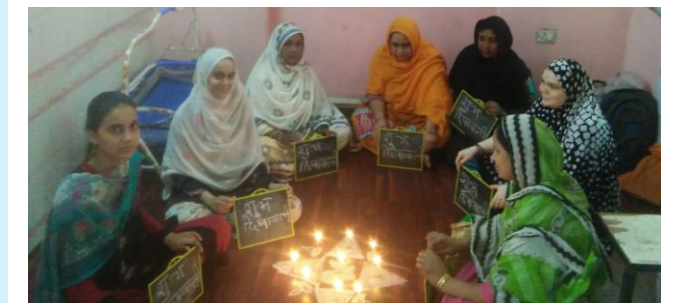
Mahila Shiksha Kendra, Yamuna Vihar