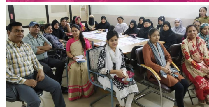
21 new MSK instructors' introductory meet at Daryaganj office on May 1