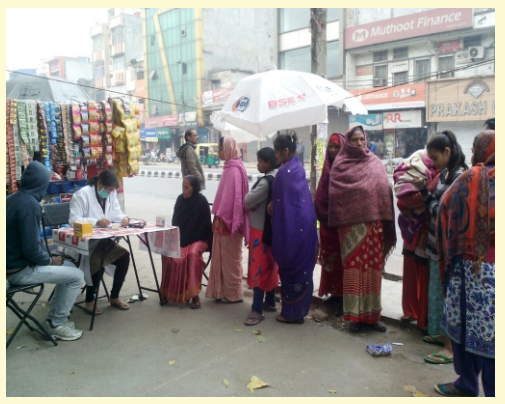
Through 10 Eye camps conducted with NGO partner Ishwar Charitable Trust and the medical team from I-Care Hospital, BYPL reached out to 2930 men and women and over 300 people were diagnosed with cataract and advised to contact hospitals for surgeries at the earliest.