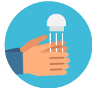
Wash / sanitise hands frequently