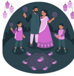
Celebrate festivals virtually