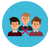
Avoid unnecessary gatherings / get-togethers