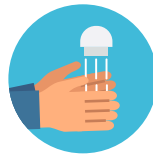
Wash / sanitise hands frequently