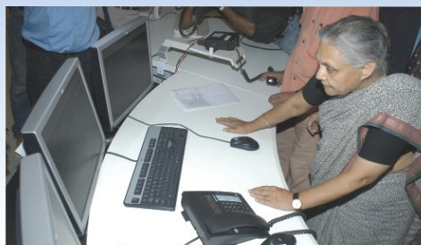
Hon'ble Chief Minister of Delhi Smt Sheila Dikshit at the SCADA Centre.

Today each and every one of you is serviced by the next generation electricity distribution management system. The ushering in of this technology - incidentally the only of its kind in the country - not only puts you in the company of global cities like Hong Kong, Stockholm, Singapore or London, but also ensures that you get quality, reliable and uninterrupted electricity supply - the last is subject to availability of sufficient power.