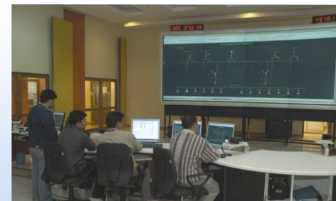
SCADA Control Centre at Kalkaji, Delhi

To ensure that BSES' paying customers continue to get uninterrupted power supply even in the wake of unforeseeable disasters and calamities, BSES has also adopted international Disaster Management practices while creating SCADA.