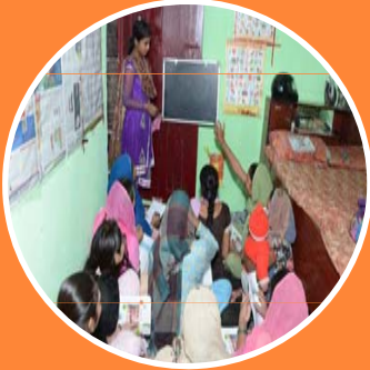
Free Eye Care Camps