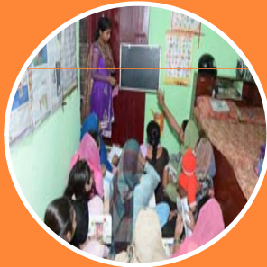
Adult Literacy Mission for Women