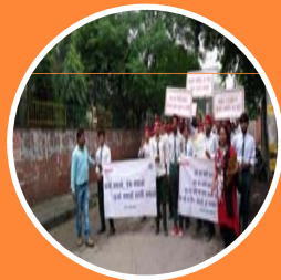
Energy Consumer Awareness Program