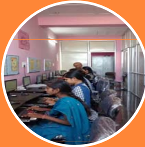
Vocational Training Center