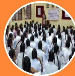
BRPL 'Energy Program' for School Children