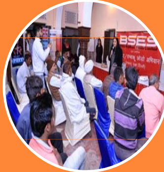
Anti Tobacco Program