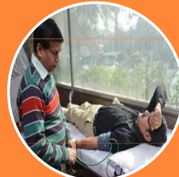
Blood Donation Camps