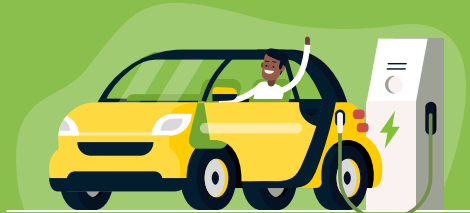
*On select models