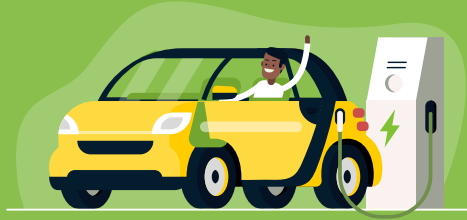
*On select models