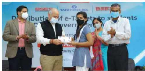
Complementing the efforts, Sisodia handed-over around 850 tablets to Delhi's Deputy

program. Through this initiative, we aim to help students laptops during the ongoing pandemic."